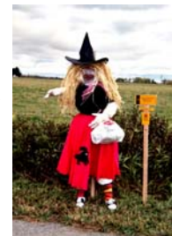
2007 Third Place Winner One of a Three way tie "Return of Dan-Yell: Nightmare On Main Street" By Valley Drug and Variety