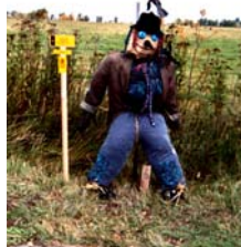
2007 Third Place Winner One of a Three way tie "Retro, The Scarecrow" By Genesis House